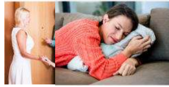
take a nap