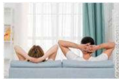
have a rest