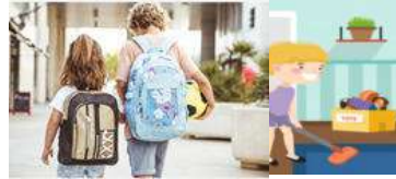
go to school