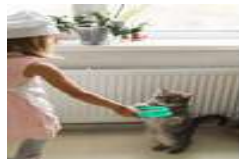
take care of the pet